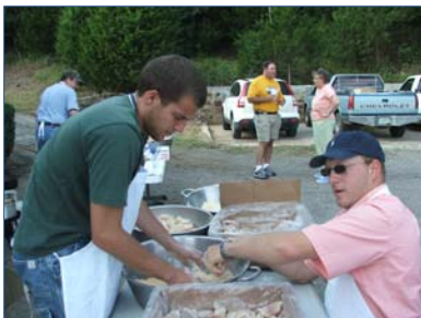
Member of the Aggie Club prepare fish for EOSC Alumni and Staff

The first Alumni Fish Fry was held in the mid-90s at Beavers Bend State Park near Broken Bow. Others have been held at Robbers Cave State Park in Wilburton and on the Wilburton campus.