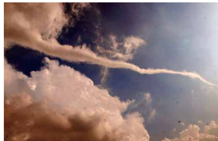
Oklahoma is known for its unpredictable weather, which makes for a very dangerous spring. This photo, taken in the McAlester area, shows a funnel cloud.