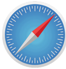
Safari for iOS